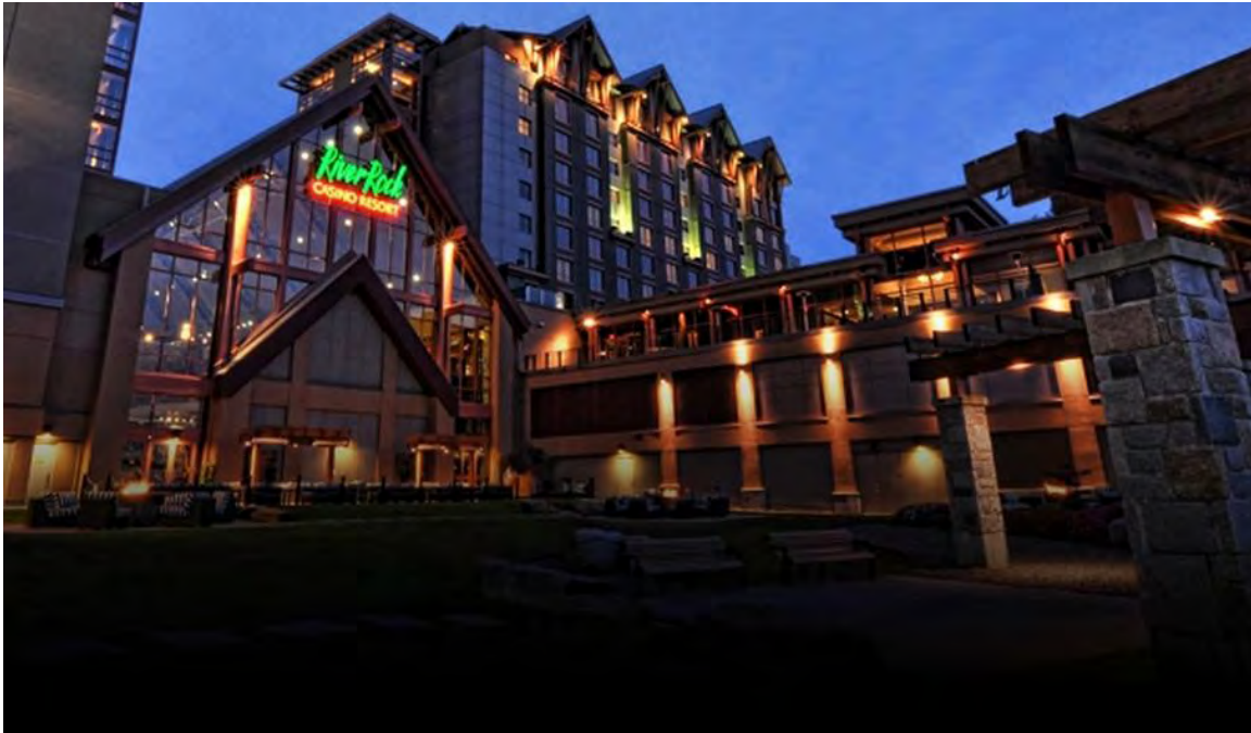
River Rock Casino, Site of the ACBL Regional Tournament, April 23-29, 2012