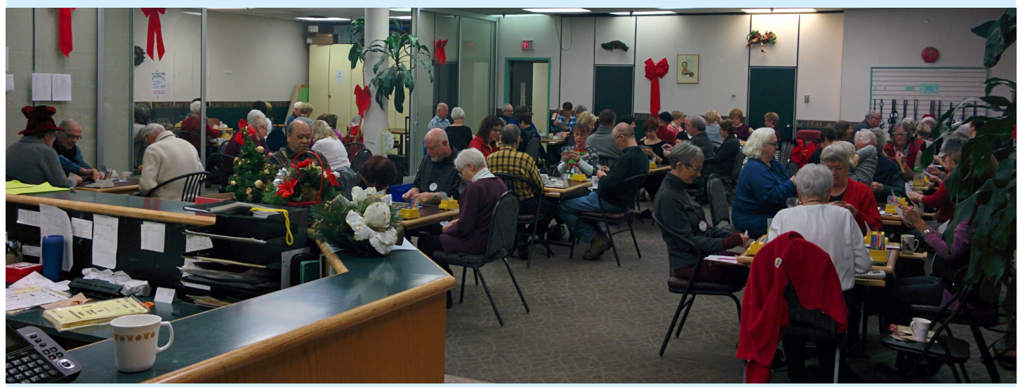
Above: A typical Thursday morning VBC game. Below : Duplicate Lite's Christmas Championship and Food Bank Charity game (30 tables) raised $2363 and 12 food boxes for the Surrey Food Bank.